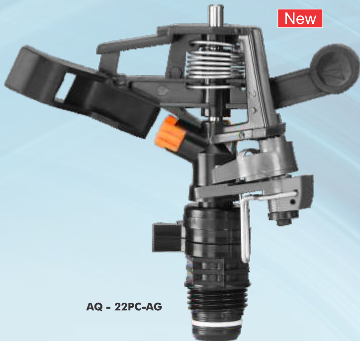
AQ - 22PC-AG